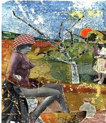
Illustration 1: The Calabash (1970)